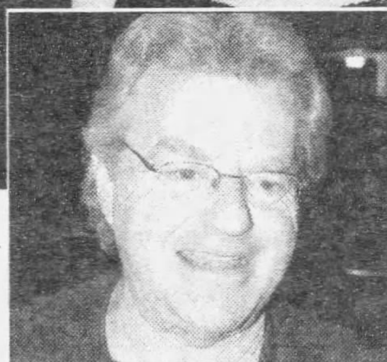
SPRINGER-AUTUMN CRUSH: Natalie Portman has a big fan in Jerry Springer.

and the former mayor of Cincinnati — likes Hillary Clinton for President in 2008.