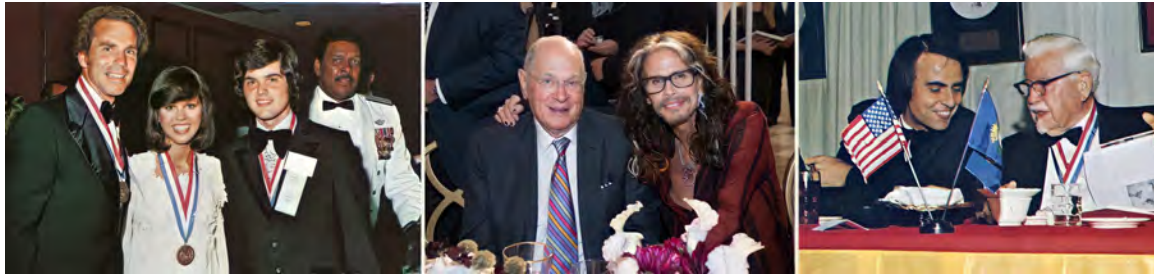
1976 Guests of honor: Dallas quarterback Roger Staubach, TV stars Donny and Marie Osmond, and General Daniel "Chappie" James, Jr., USAF.; Golden Plate Awards Council member Anthony M. Kennedy, Justice of the United States Supreme Court, and Aerosmith lead singer Steven Tyler exchanging ideas at dinner at The Met during the 2019 Summit.; Astronomer Carl Sagan and Col. Harland Sanders at the 1975 Golden Plate ceremonies head table.

The International Achievement Summit can best be described as a global celebration of the human spirit to excel that lies at the heart of the American Dream. Its honored guests are those who have made a significant difference in today's world through individual effort in their own fields of endeavor. The roster of Academy members reads like a "Who's Who" of achievement and includes many Nobel, Pulitzer, National Medal of Science, Business Hall of Fame, Presidential Medal of Freedom, Congressional Gold Medal, Medal of Honor, Tony, Grammy, Emmy, and Oscar winners.