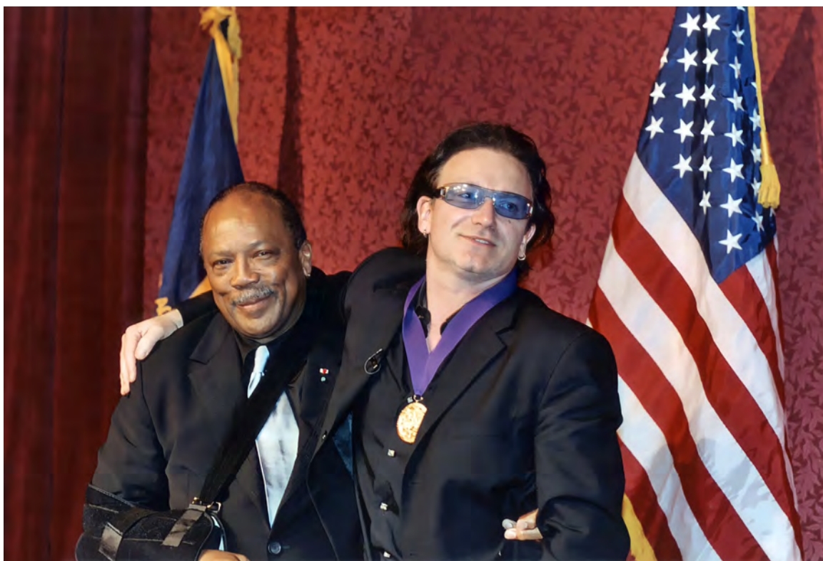
Music impresario and Golden Plate Awards Council member Quincy Jones inducts famed musician and activist Bono into the Academy during the introductory dinner of the 2002 International Achievement Summit in Dublin.

The one-on-one video interviews of more than 200 Academy honorees are featured on the Academy of Achievement's website, www.achievement.org , alongside multimedia curriculum modules and a podcast center of selected symposium presentations from the annual International Achievement Summit. The website also hosts a collection of biographies and historic photographs of these Academy members. Visitors can access our online library and discover which books influenced the early lives of our honorees.