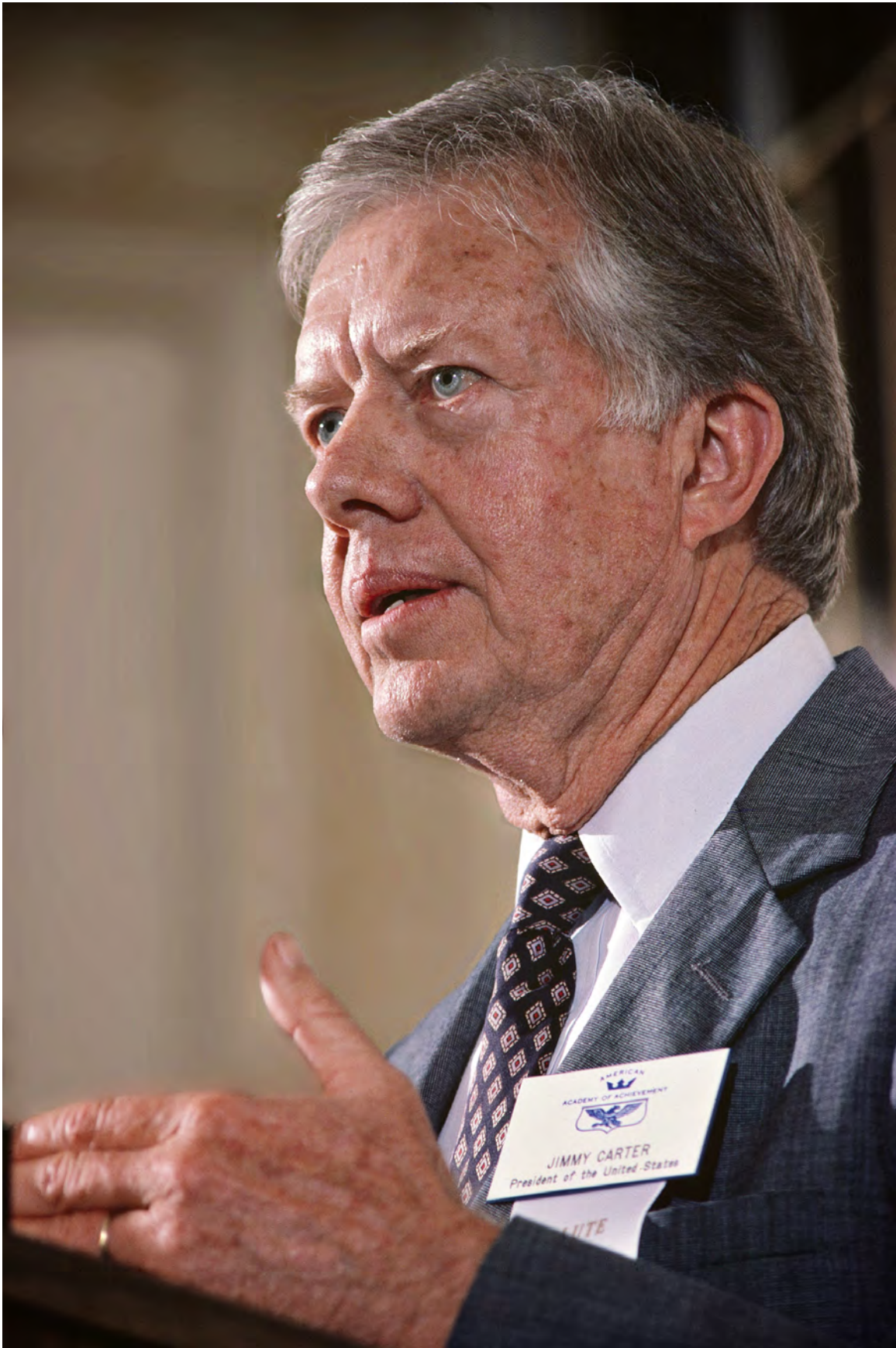
President Jimmy Carter addresses the assemblage of Academy of Achievement members and student delegates during the 1984 "Salute to Excellence" program at the historic Lafayette Club outside of Minneapolis, Minnesota.