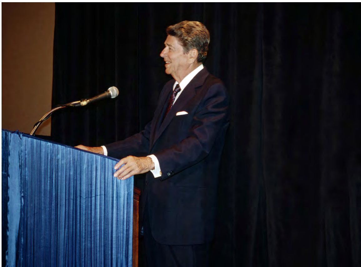
President Ronald W. Reagan addressing the Academy of Achievement delegates at the 1990 Summit in Chicago.

The Academy has provided thousands of outstanding young scholars, scientists and social entrepreneurs with all-expense-paid life-changing experiences, through which the rising generations whose dreams will determine our collective tomorrow have drawn inspiration from those individuals who have shaped our world of today.