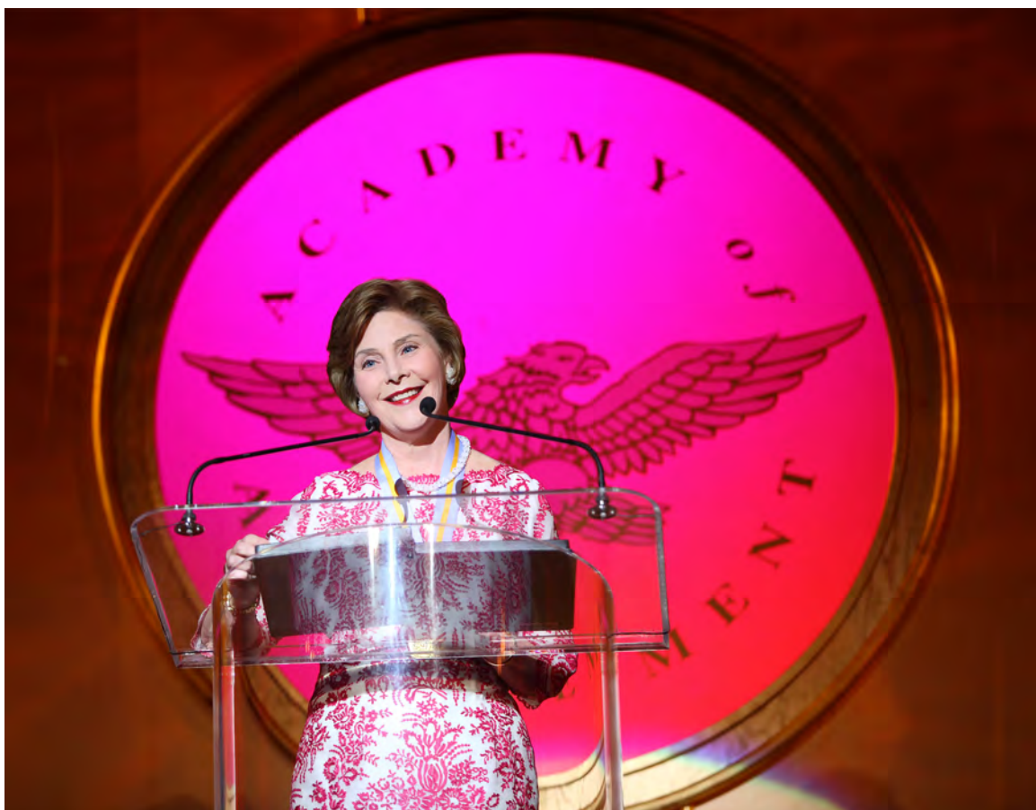
First Lady Laura Bush, a 2007 Academy guest of honor, welcomes the delegates and members to the 46th annual Banquet of the Golden Plate ceremonies during the International Achievement Summit held in Washington, D.C.