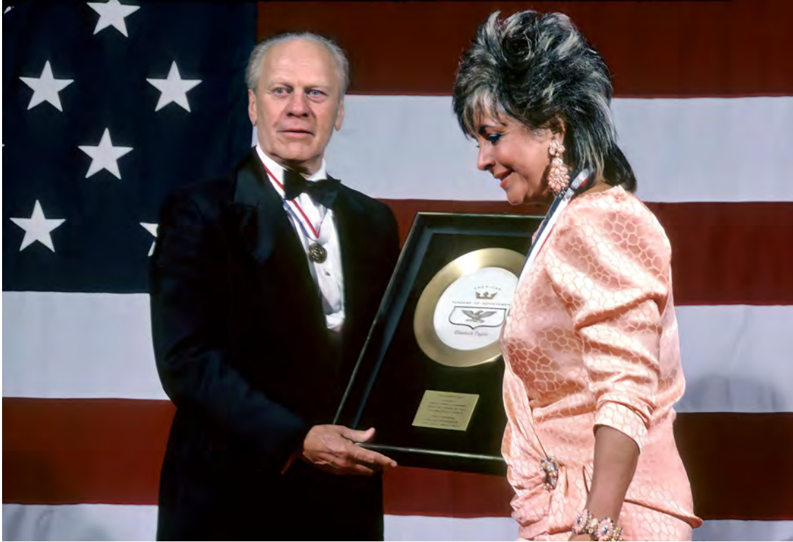
Awards Council member, President Gerald R. Ford, presents the Golden Plate Award to Elizabeth Taylor, recipient of two Oscars for Best Actress, at the American Academy of Achievement's 1985 ceremonies in Denver, Colorado.

The Academy's Golden Plate Awards Council , comprised of past honorees of the Academy, annually reviews a broad spectrum of candidates for invitation to the Summit. From this list, the Awards Council selects 30 new Academy honorees. The highlight of the annual International Achievement Summit occurs on the final evening of the gathering at the Banquet of the Golden Plate. At the ceremony, each honoree is presented with the Golden Plate Award and the Academy of Achievement gold medal as a "representative of the many who excel" in their chosen professions.