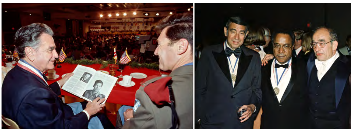
Left: The Honorable John J. Sirica, Watergate trial judge and Time magazine's Man of the Year, with General Dan Shomron, paratroop commander of the Entebbe Airport rescue of 103 high-jacked hostages and later the Chief of Staff of the Israeli Defense Forces, on the head table at the 16th annual Banquet of the Golden Plate ceremonies in Orlando, Florida. Right: Academy guests of honor: sports journalist Howard Cosell, Alex Haley, the Pulitzer Prize-winning author of Roots: The Saga of an American Family , and the Emmy Award-winning actor Edward Asner at the 1977 Banquet of the Golden Plate during the American Academy of Achievement Summit held in Orlando, Florida.

In 2011, the Academy of Achievement published a library of more than 500 exclusive audio and video symposium presentations from its annual Summits on Apple Podcasts. The Academy has continued to add to this collection, which now spans more than 30 years, from 1981 to 2017. Academy of Achievement podcasts are available to the public on Apple Podcasts, free of charge, under the Creative Commons License. In 2015, the Academy launched a podcast series, What It Takes , on iTunes. The podcast presents the life stories and reflections of Academy members who have had a huge impact on the world, and insights you can apply to your own life. What It Takes has received millions of downloads on Apple Podcasts.