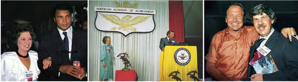
1986, The American Academy of Achievement's 25th-anniversary Summit at historic Mount Vernon, Virginia: (Left) Screen legend Shirley Temple Black with 3-time Heavy Weight Boxing Champion of the World Muhammad Ali at a reception. (Center) Neil Armstrong, the first man on the moon and Academy Class of 1973, addressing the Summit delegates and members as Summit moderator Olivia de Havilland looks on. (Right) The internationally-acclaimed artist, Robert Rauschenberg, with Council member, paleontologist and evolutionary biologist, Stephen Jay Gould.

These gatherings take on special significance in light of our vastly changing world. The opportunity for students of various lands and faiths to enter into meaningful, reasoned dialogue with eminent leaders from diverse fields ignites hope for the future. Without greater understanding between nations, there can be no lasting peace, and this kind of intellectual discourse between individual leaders, both present and future, is essential to establishing such an understanding.