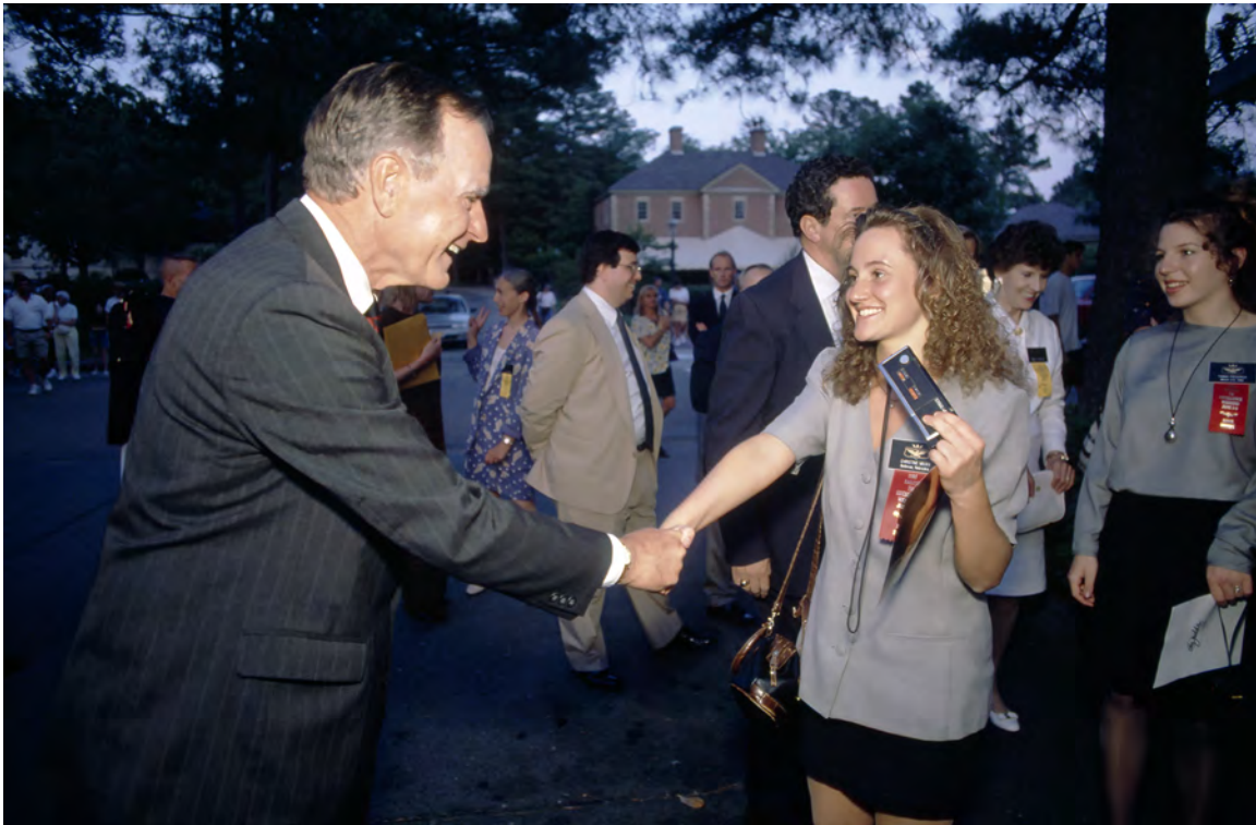
President George H.W. Bush, Golden Plate awardee, meets delegates at the 1995 Summit in Colonial Williamsburg.

These gatherings take on special significance in light of our vastly changing world. The opportunity for students of various lands and faiths to enter into meaningful, reasoned dialogue with eminent leaders from diverse fields ignites hope for the future. Without greater understanding between nations, there can be no lasting peace, and this kind of intellectual discourse between individual leaders, both present and future, is essential to establishing such an understanding.