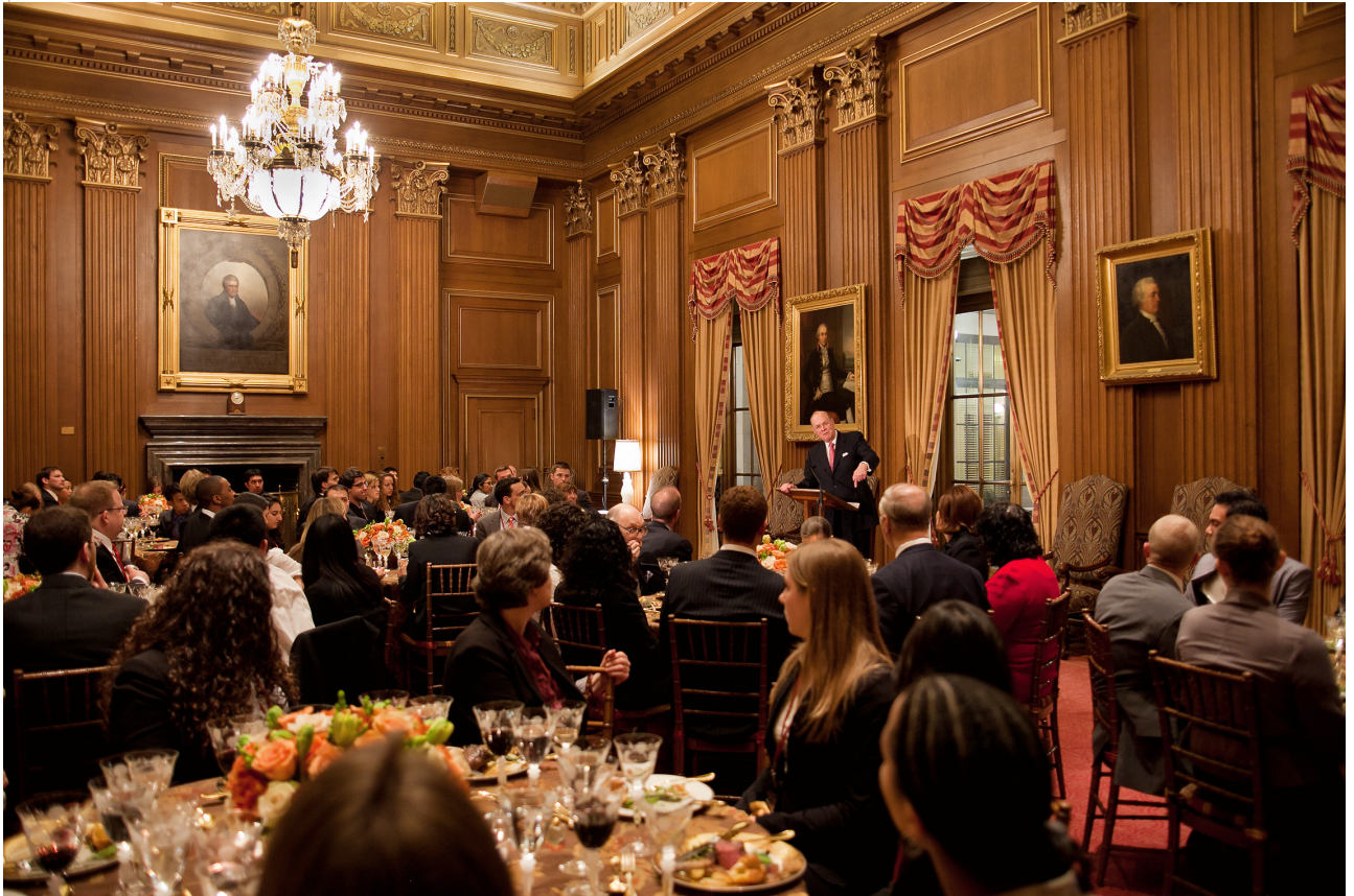
Awards Council member Justice Anthony Kennedy addresses the American Academy of Achievement delegates at the United States Supreme Court during the introductory dinner of the 2010 International Achievement Summit.