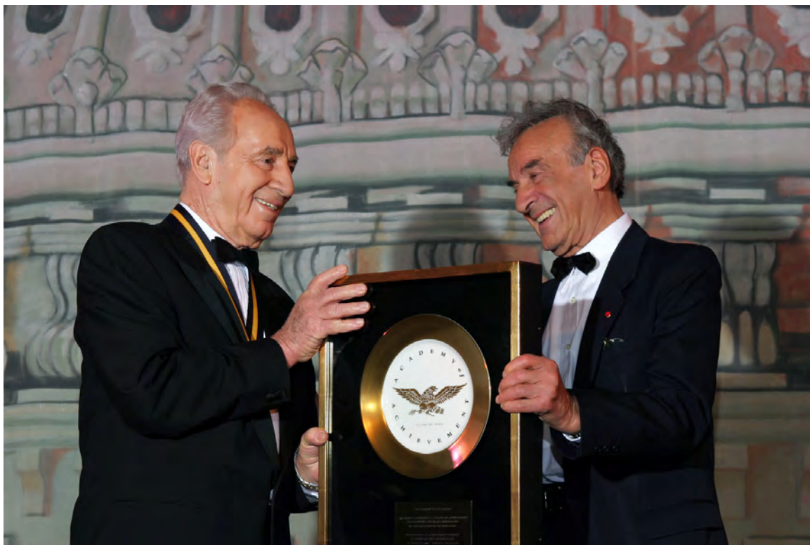
Awards Council member and Nobel Peace Prize laureate Dr. Elie Wiesel presents the Academy of Achievement's Golden Plate Award to Shimon Peres at 2003 International Achievement Summit ceremony in Washington, D.C.