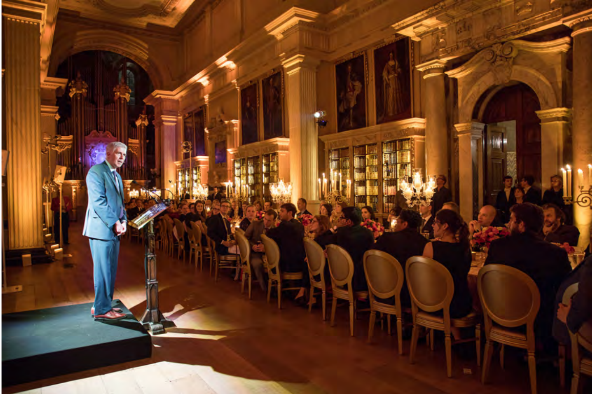
Neil M. Gorsuch, Justice of the Supreme Court of the United States, addresses the Academy members and Marshall Scholars at historic Blenheim Palace in Oxfordshire, England, during the 2017 International Achievement Summit.

The lives of legendary achievers have endlessly fascinated the public. We marvel at George Washington's selfless commitment to his country, Thomas Edison's vision, Helen Keller's courage. Such heights, young people often believe, could only have been scaled by someone of unparalleled genius, or persons born to privilege, or those favored by sheer luck. However, the lives and words of these heroes reveal a different story. Few were born rich. They were no more lucky or unlucky than their contemporaries. They were individuals like us, beset by the same challenges that human beings have faced throughout the ages. Their greatness lies not in accidents of birth or good fortune, but in how they met and overcame the extraordinary challenges they faced in their own lives.