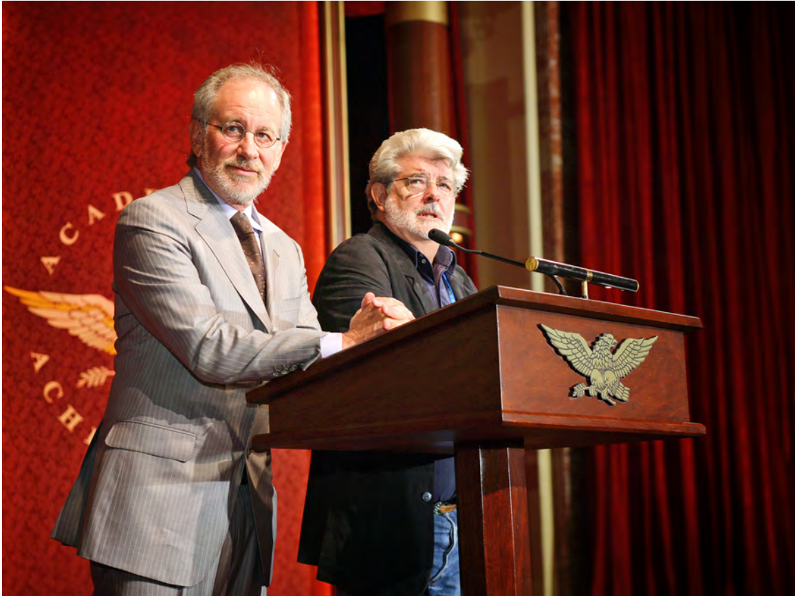
Golden Plate Awards Council members and 2006 Summit Hosts Steven Spielberg and George Lucas welcome the Academy delegates and members to the 45th annual International Achievement Summit in Los Angeles, California.

Through state-of-the-art technology, visitors are brought into contact with the Academy honorees who have helped shape our times. In their own words, these leaders and visionaries share the path to their achievements, as well as candid insights into their own personal and professional lives. The contributions of these individuals to humanity's progress during the past century, and their spirit of innovation and ingenuity, will be preserved in the Academy's museum to inspire the creative thinking of future generations.