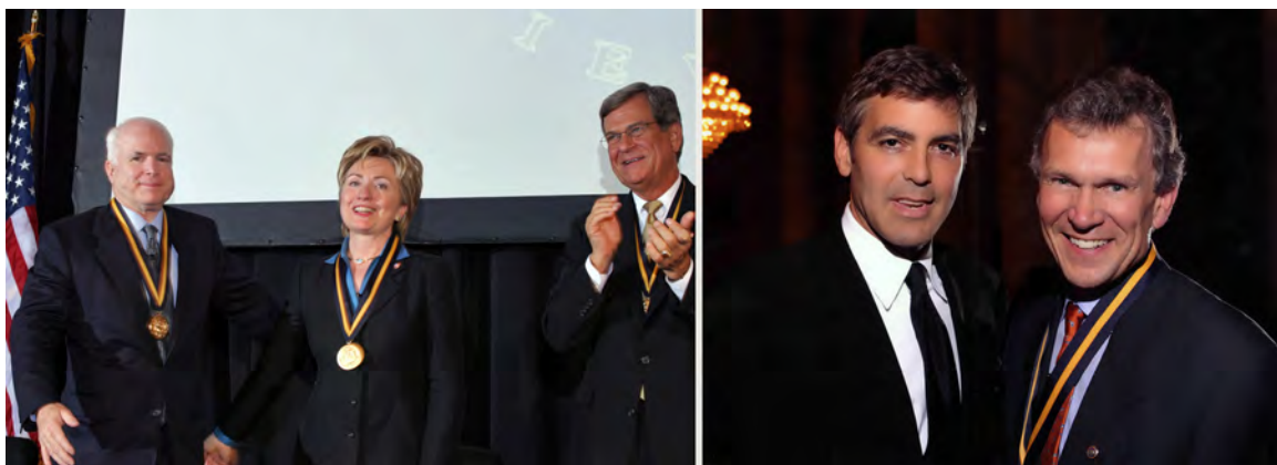
Left: U.S. Senators John McCain, Hillary Clinton and Trent Lott receive their Academy of Achievement Gold Medals at a symposium and awards ceremony held at the U.S. Capitol during the 42nd International Achievement Summit in Washington, D.C. Right: Actor George Clooney and Senator Tom Daschle chat after the summit symposium and awards ceremony at the U.S. Capitol during the 2003 International Achievement Summit held in Washington, D.C.

The Academy is a nonprofit organization within the meaning of Section 501(c)(3) of the U.S. Internal Revenue Code. All contributions to the Endowment Fund and to the Academy itself are tax-deductible under federal law.