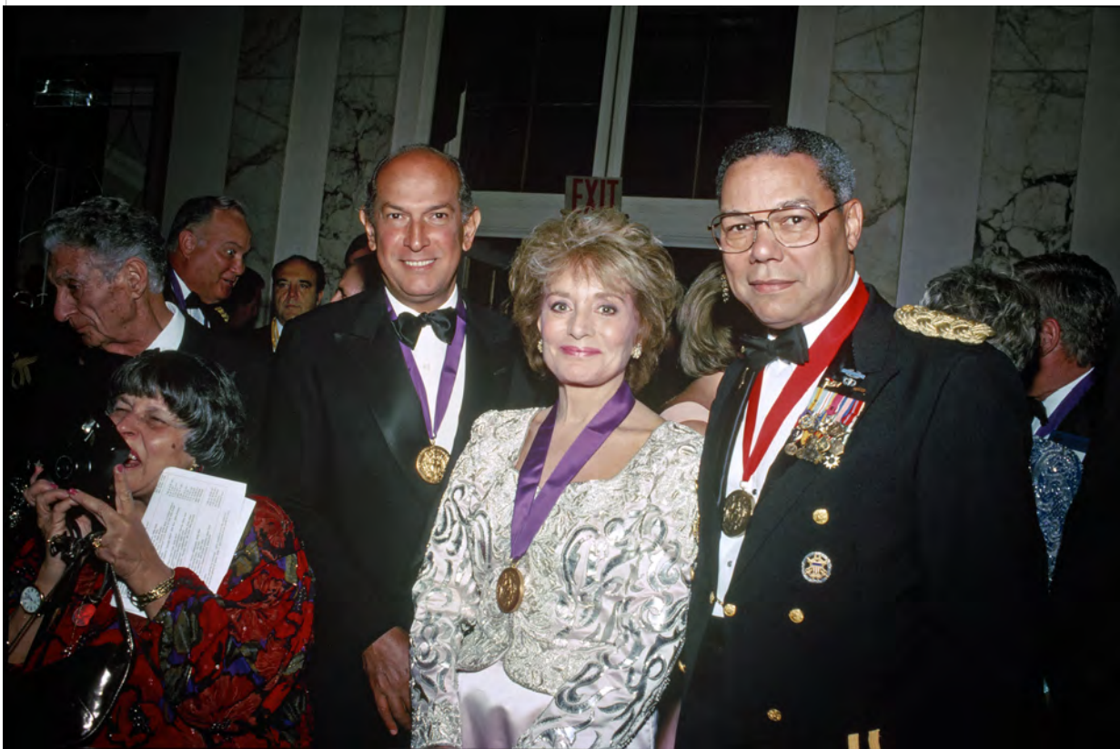
Awards Council member General Colin L. Powell at the 1991 Banquet of the Golden Plate ceremonies in New York City with Academy of Achievement inductees: fashion designer Oscar de la Renta and journalist Barbara Walters.