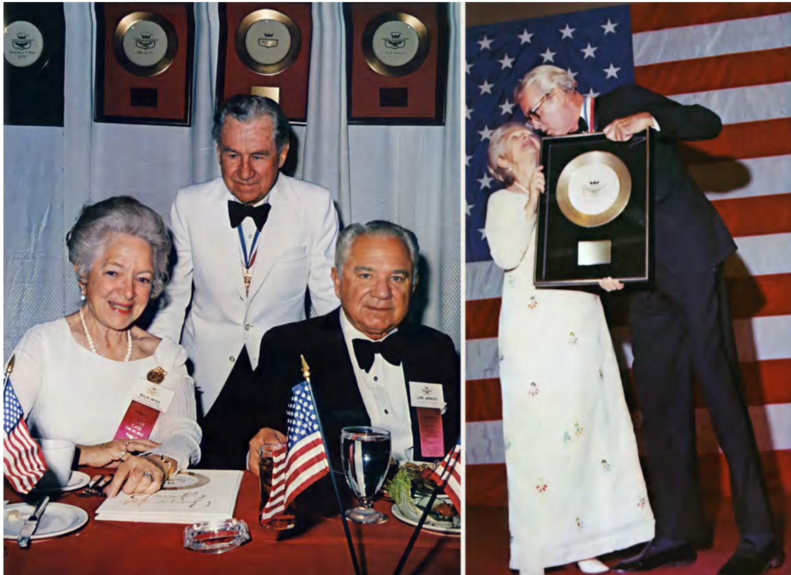
Left: Members of the Awards Council: award-winning actress Helen Hayes, pioneer TV newscaster Lowell Thomas, and famed attorney Leon Jaworski at the American Academy of Achievement's 1974 Banquet of the Golden Plate Award ceremonies in Salt Lake City, Utah. Right: Council member Helen Hayes presents the Golden Plate Award to screen legend Jimmy Stewart at the 1974 Banquet of the Golden Plate Award ceremonies in Salt Lake City, Utah.

In 2011, the Academy of Achievement published a library of more than 500 exclusive audio and video symposium presentations from its annual Summits on Apple Podcasts. The Academy has continued to add to this collection, which now spans more than 30 years, from 1981 to 2017. Academy of Achievement podcasts are available to the public on Apple Podcasts, free of charge, under the Creative Commons License. In 2015, the Academy launched a podcast series, What It Takes , on iTunes. The podcast presents the life stories and reflections of Academy members who have had a huge impact on the world, and insights you can apply to your own life. What It Takes has received millions of downloads on Apple Podcasts.