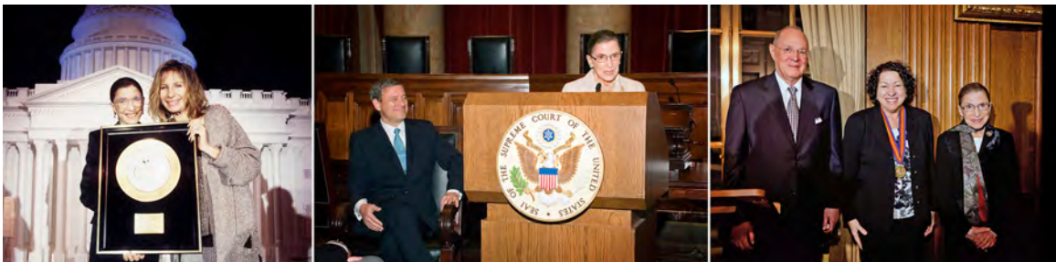
U.S. Supreme Court Justice Ruth Bader Ginsburg receives the Golden Plate Award of the Academy of Achievement from Awards Council member Barbra Streisand at the Academy's 1995 Summit in Colonial Williamsburg, Virginia; Chief Justice John G. Roberts, Jr. and Awards Council member Justice Ruth Bader Ginsburg speak with Academy delegates during an evening symposium and dinner at the United States Supreme Court at the 2007 International Achievement Summit in Washington, D.C.; Awards Council members Justices Anthony Kennedy and Ruth Ginsburg present the Academy of Achievement's Gold Medal to Justice Sonia Sotomayor at the 2012 Summit in Washington.

The outstanding scholars, scientists and social entrepreneurs selected to attend the International Achievement Summit are chosen from among the most distinguished young people in the world. The graduate student attendees are selected through a roster of prestigious international fellowship and scholarship programs, such as the Howard Hughes Medical Institute's Medical Research Fellowship, the Rhodes Scholarship Trust, the Truman Scholarship Foundation, White House Fellows Program, the Paul and Daisy Soros Foundation Fellowship, the Marshall Scholarship, Gates Cambridge Fellowship, and the Catherine B. Reynolds Foundation Fellowship Program for Social Entrepreneurship.