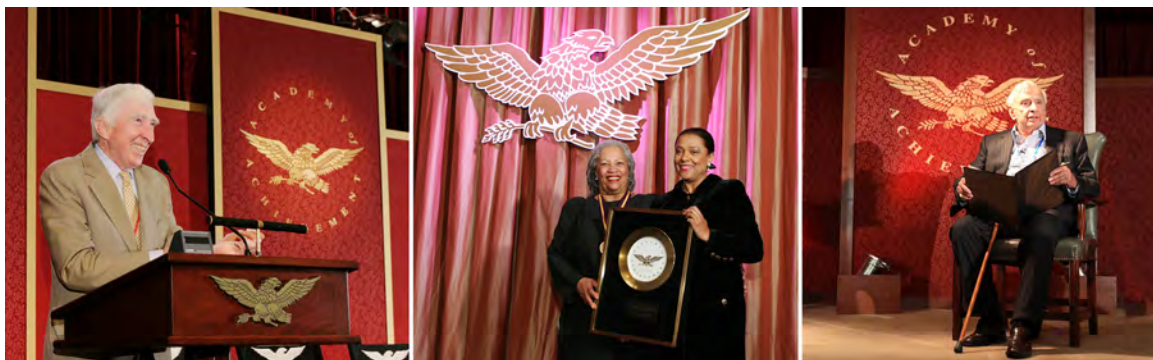
Legendary Writers: Pulitzer Prize-winning novelist John Updike addressing Academy students and delegates at a symposium during the 2004 International Achievement Summit in Chicago, Illinois; Awards Council member and famed operatic soprano Kathleen Battle presenting the American Academy of Achievement's Golden Plate Award to Toni Morrison, the recipient of the Nobel Prize in Literature, at the Banquet of the Golden Plate gala ceremonies during the 2005 International Achievement Summit in New York City; Admired novelist and social critic Gore Vidal addressing Academy delegates and members during the 2006 International Achievement Summit in Los Angeles.

The one-on-one video interviews of more than 200 Academy honorees are featured on the Academy of Achievement's website, www.achievement.org , alongside multimedia curriculum modules and a podcast center of selected symposium presentations from the annual International Achievement Summit. The website also hosts a collection of biographies and historic photographs of these Academy members. Visitors can access our online library and discover which books influenced the early lives of our honorees.