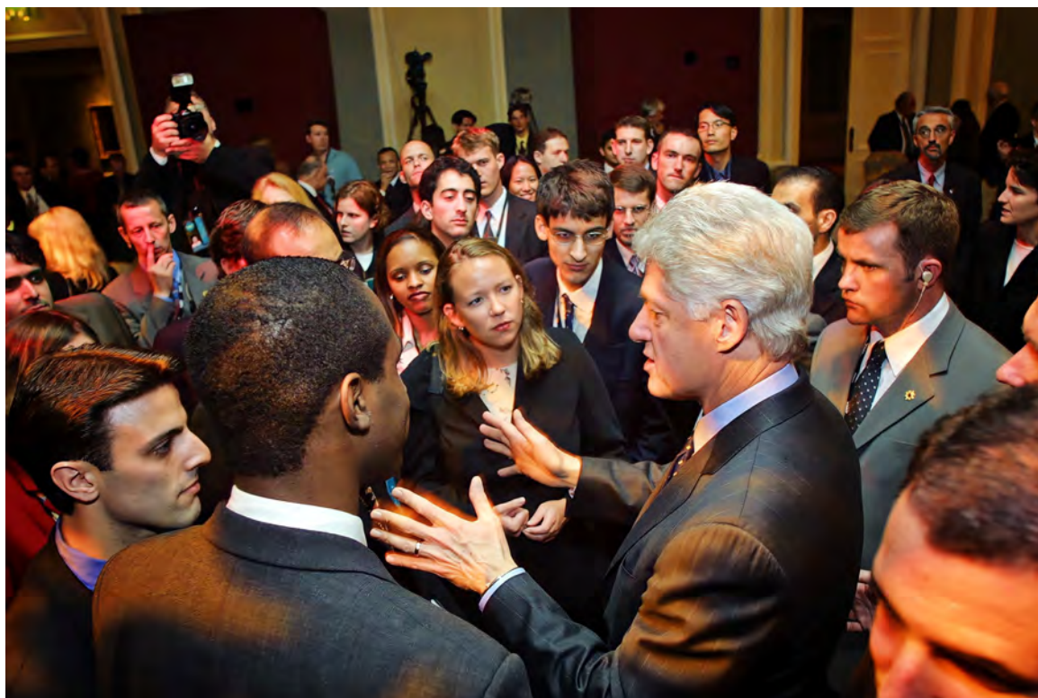
President Bill Clinton speaking to the Academy delegates at the 2002 International Achievement Summit in Dublin.