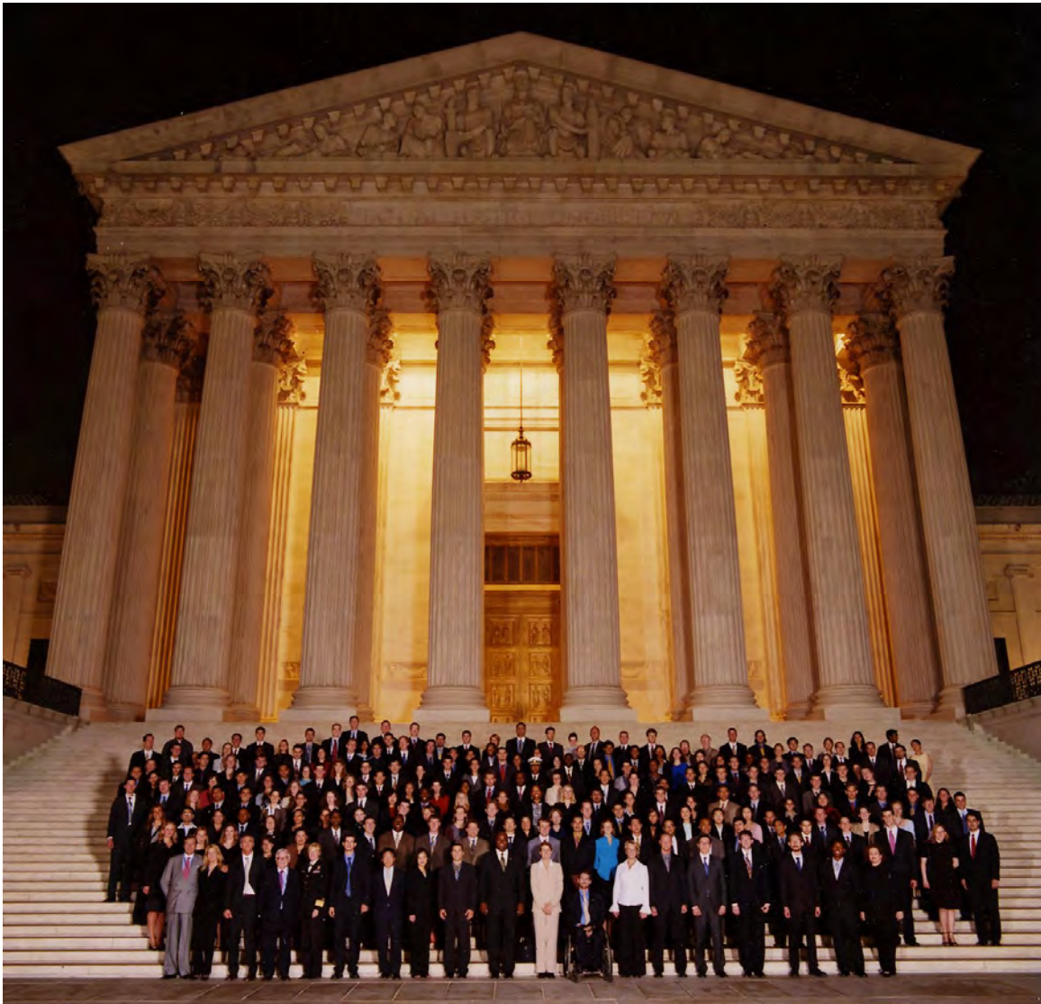
2003: International student delegates of the American Academy of Achievement at United States Supreme Court after a dinner hosted by Awards Council members Justice Sandra Day O'Connor and Justice Ruth Bader Ginsburg.

The outstanding scholars, scientists and social entrepreneurs selected to attend the International Achievement Summit are chosen from among the most distinguished young people in the world. The graduate student attendees are selected through a roster of prestigious international fellowship and scholarship programs, such as the Howard Hughes Medical Institute's Medical Research Fellowship, the Rhodes Scholarship Trust, the Truman Scholarship Foundation, White House Fellows Program, the Paul and Daisy Soros Foundation Fellowship, the Marshall Scholarship, Gates Cambridge Fellowship, and the Catherine B. Reynolds Foundation Fellowship Program for Social Entrepreneurship.