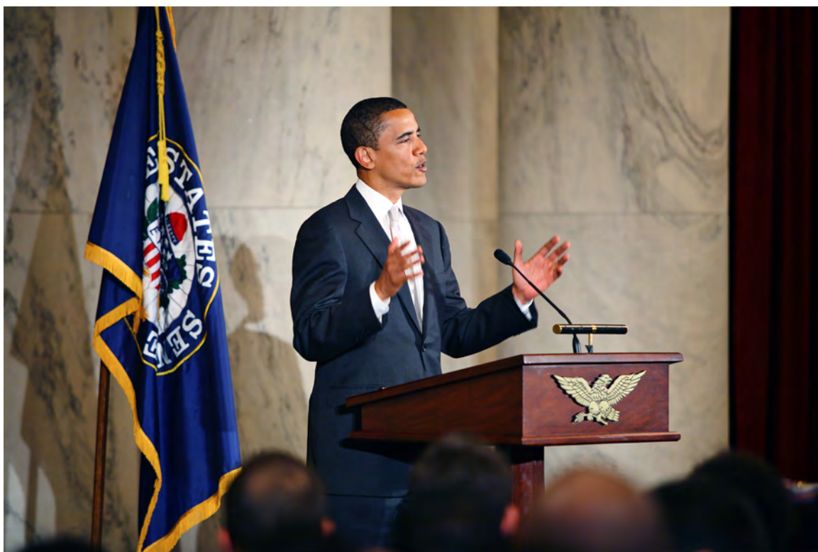
President Barack Obama addressing the delegates at the 46th annual Achievement Summit in Washington, D.C.

The Academy of Achievement held its first annual International Achievement Summit in 1999. The forum gives exceptional scholars from around the world the opportunity to interact with preeminent achievers. The Academy invites leaders in diverse fields of endeavor to attend the Summit and participate in a series of symposiums and roundtable discussions. Approximately 80 men and women — 50 distinguished previous awardees and 30 new honorees — interact with 100 delegates — graduate students, research fellows, scholars, young scientists, physicians and social entrepreneurs — over the course of several days in an informal setting.