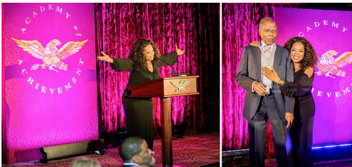
2014: Golden Plate Awards Council member and 1989 Academy guest of honor Oprah Winfrey introducing legend of American cinema, Sidney Poitier, at an American Academy of Achievement ceremony in Los Angeles, California; Oprah Winfrey presents one of her lifelong heroes, Sidney Poitier, with the Academy of Achievement's Gold Medal.

The following is a partial list of Golden Plate honorees. These visionaries and pioneers — whose ideas and talents have influenced the world — have all participated in the annual International Achievement Summit and addressed the student delegates. They are listed with the year of their induction into the Academy. A more comprehensive Summary of Golden Plate recipients, grouped by decade and field of endeavor, is also available.