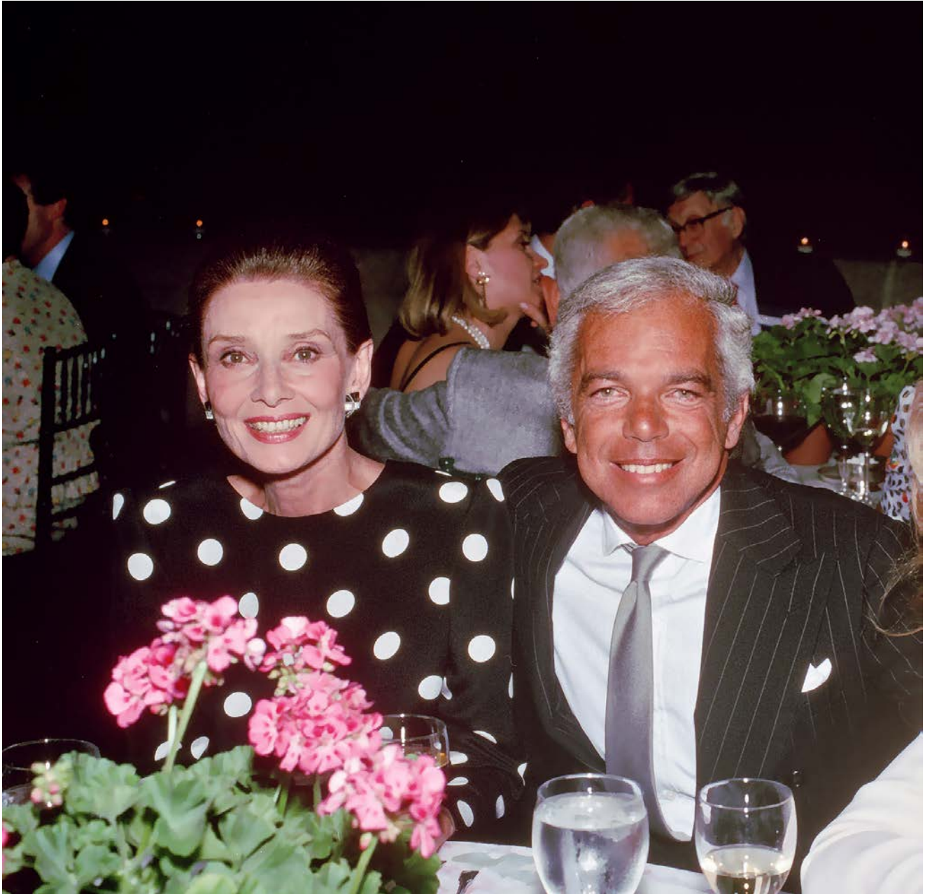
1991: Academy guest of honor and screen legend Audrey Hepburn with famed fashion designer and Golden Plate Awards Council member Ralph Lauren at the American Academy of Achievement's dinner held in New York City.

In June 2002, the 41st annual Salute to Excellence program and the third International Achievement Summit took place simultaneously in historic Dublin, capital of the Republic of Ireland. The Academy of Achievement invited 50 men and women of exceptional accomplishment (30 past honorees and 20 new awardees) to share their wisdom and experience with 200 outstanding graduate students from 40 countries in the disciplines of law, medicine, genetics, the sciences, engineering, economics, finance, journalism, international relations and diplomacy.