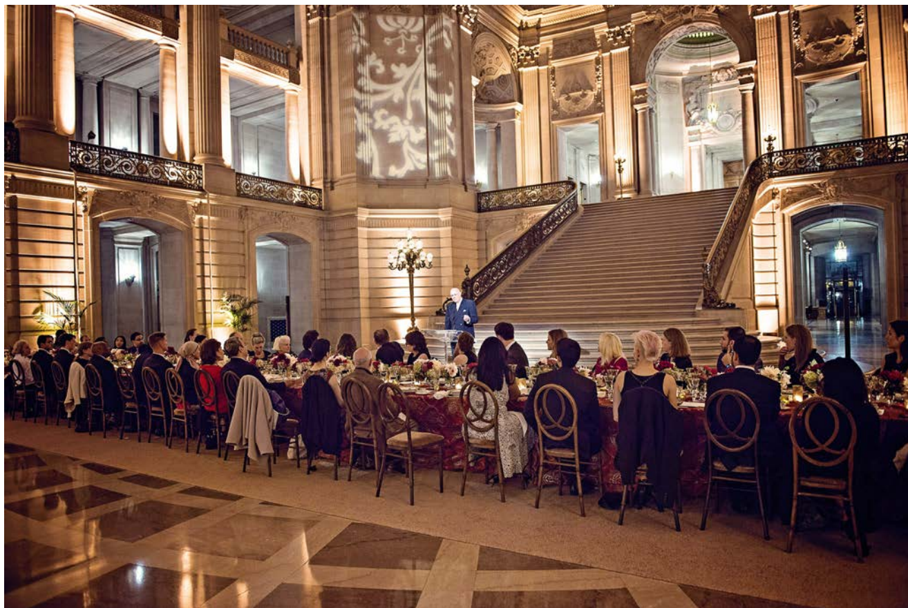
Justice Anthony M. Kennedy addresses the Academy delegates at the 2014 Achievement Summit in San Francisco.

For the inaugural Summit in Budapest, more than 100 outstanding international graduate students were selected by the Academy from nominations submitted by administrators of such international exchange programs as the Rhodes Scholarship Trust, Truman Scholarship Foundation and Fulbright Scholarship program.