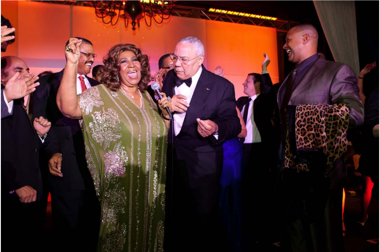
2012: Queen of Soul Aretha Franklin is joined onstage by Awards Council member General Colin Powell during her memorable musical performance to close the evening of the 50th annual Banquet of the Golden Plate ceremonies.

Additional student delegates were designated by the faculty of leading institutions around the world, including Harvard Law School, the Wharton School at the University of Pennsylvania, Georgetown University School of Foreign Service, the Sanger Centre at Cambridge, MIT School of Engineering, Columbia Graduate School of Journalism, Sofia University School of International Relations in Bulgaria, University College Dublin, the Max Planck Institute in Berlin, the Woodrow Wilson School of Public and International Affairs at Princeton, Institut d'Etudes Politiques de Paris, Moscow Institute of International Relations, Diplomatic Academy of Vienna, and the United States Military Academy, Naval Academy and Air Force Academy.