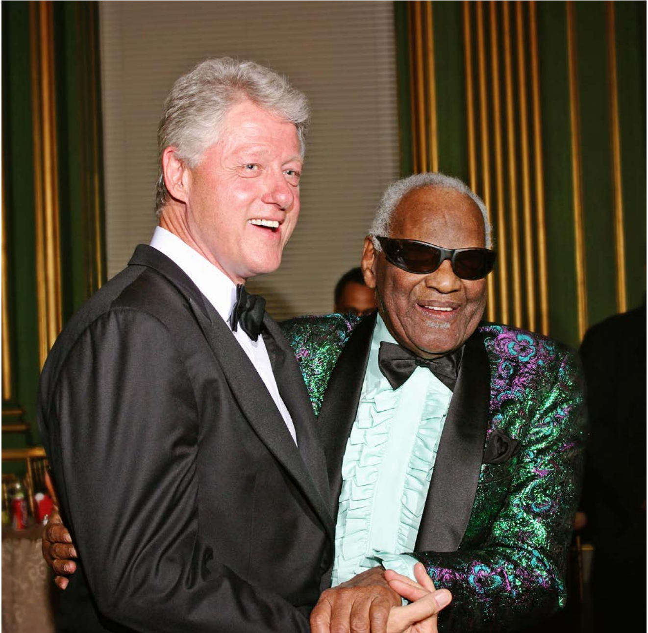
Golden Plate Awards Council member President Bill Clinton with the acclaimed singer and musician, Ray Charles, a 1975 American Academy of Achievement guest of honor, at the 2003 Banquet of the Golden Plate in Washington.

The 1999 International Achievement Summit also included a dialogue on the expansion of NATO with His Excellency Viktor Orbán, Prime Minister of the Republic of Hungary, in the historic Parliament building; a summary of the Kosovo crisis by General Wesley K. Clark, USA, the Supreme Allied Commander Europe; and a conversation on the pursuit of NATO membership with Her Excellency Nadezhda Mihailova, Foreign Minister of Bulgaria, and His Excellency Valdas Adamkus, President of the Republic of Lithuania.