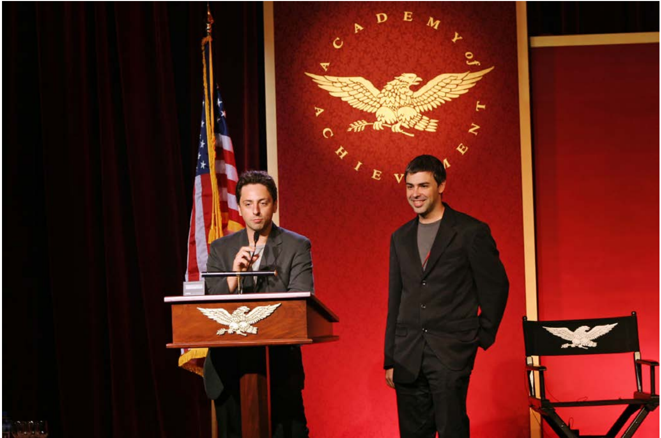
Chicago 2004: Google co-founders Sergey Brin and Larry Page, former Academy delegates at 2000 International Achievement Summit, returned as Golden Plate Awardees and symposium presenters at the 43rd annual Summit.

Delegate nominations were also provided by the faculty of more than 25 institutions, including the John F. Kennedy School of Government at Harvard, the Fletcher School of Law and Diplomacy at Tufts, Georgetown University School of Foreign Service, Woodrow Wilson School of Public and International Affairs at Princeton, Institute of Political Studies in Paris, School of Advanced International Studies at Johns Hopkins, Stanford Business School, Harvard Law School, United States Military Academy, Naval Academy and Air Force Academy.