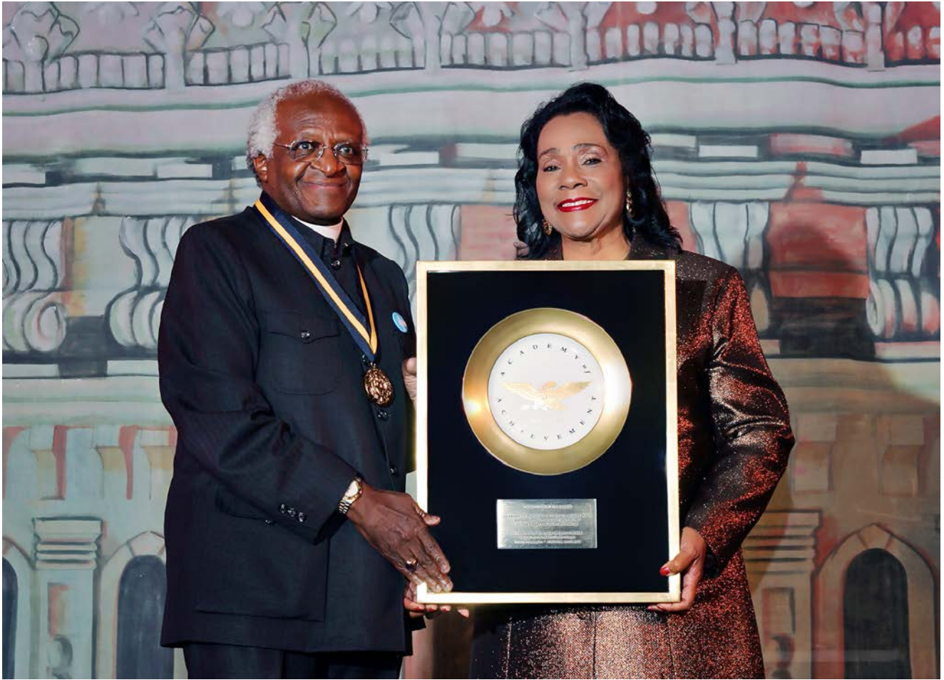
South Africa's Archbishop Desmond M. Tutu receives the American Academy of Achievement's Golden Plate Award from Council member Coretta Scott King during the 2003 International Achievement Summit in Washington, D.C.

Featured speakers included Bertie Ahern, Prime Minister of the Republic of Ireland; Latvian President Vaira Vike-Freiberga; NATO Secretary-General Lord Robertson; Benazir Bhutto, former Prime Minister of Pakistan; Lech Walesa, the former President of Poland; and Mikhail Gorbachev, former Premier of the Soviet Union.