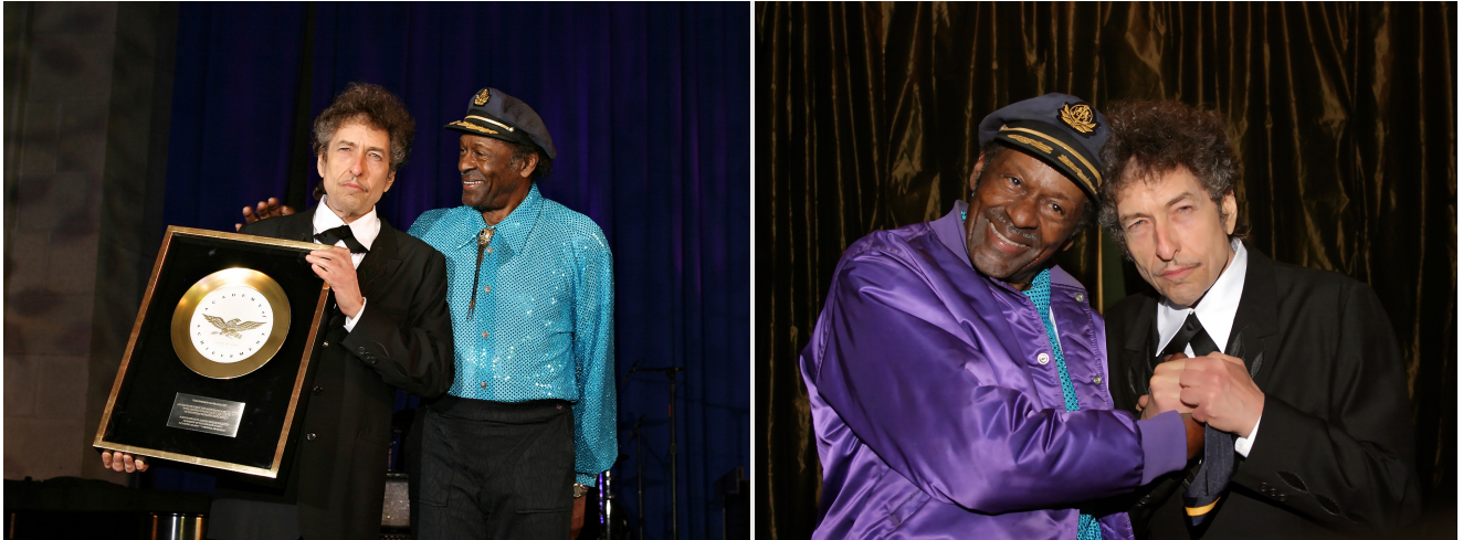
2003: Awards Council member and pioneer of rock and roll music Chuck Berry presents the American Academy of Achievement's Golden Plate Award to the legendary singer-songwriter and musician Bob Dylan at the Banquet of the Golden Plate ceremonies during the 42nd annual International Achievement Summit held in Washington, D.C.

The Academy members and graduate students participated in a number of memorable and inspiring events during the Summit, highlighted by presentations in the Palace of Justice from His Excellency Árpád Göncz, President of the Republic of Hungary, and Dr. Bronislaw Geremek, Foreign Minister of Poland, on their imprisonment by communist governments and their commitment to democracy.