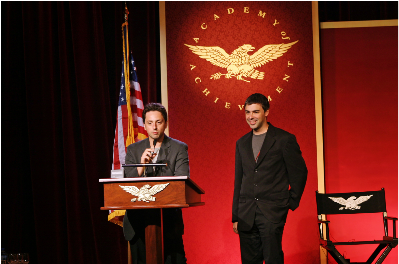
Chicago 2004: Google co-founders Sergey Brin and Larry Page, former Academy delegates at 2000 International Achievement Summit, returned as Golden Plate Awardees and symposium presenters at the 43rd annual Summit.

Delegate nominations were also provided by the faculty of more than 25 institutions, including the John F. Kennedy School of Government at Harvard, the Fletcher School of Law and Diplomacy at Tufts, Georgetown University School of Foreign Service, Woodrow Wilson School of Public and International Affairs at Princeton, Institute of Political Studies in Paris, School of Advanced International Studies at Johns Hopkins, Stanford Business School, Harvard Law School, United States Military Academy, Naval Academy and Air Force Academy.