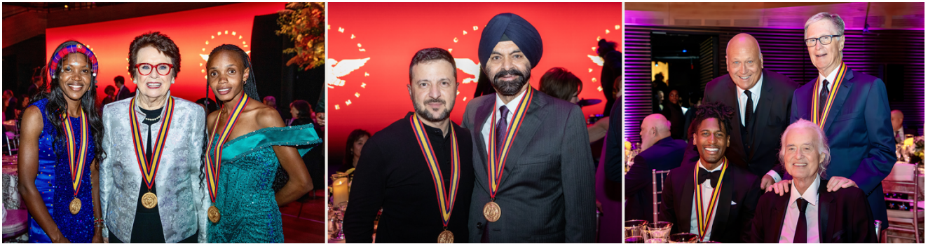
September 22, 2024: The Academy of Achievement's 55th Banquet of the Golden Plate at David Geffen Hall, Lincoln Center, New York City. (Left) Guests of Honor: World Athlete of the Year Faith Kipyegon, Presidential Medal of Freedom recipient Billie Jean King, and Olympic Gold Medalist Beatrice Chebet. (Center) Ukrainian President Volodymyr Zelenskyy with World Bank President Ajay Banga. (Right) Baseball Hall of Famer Cal Ripken Jr., Boston Red Sox owner John W. Henry, Singer-Songwriter Jon Batiste, and Led Zeppelin founder and guitarist Jimmy Page.

In 2024, the Banquet of the Golden Plate was held in the distinguished setting of David Geffen Hall at Lincoln Center, New York City, home of the New York Philharmonic. This prestigious event celebrated an illustrious group of honorees, including Nobel laureates, Grammy and Pulitzer Prize winners, heads of state, and Presidential Medal of Freedom recipients. The evening brought together extraordinary figures from diverse fields—such as the arts, athletics, literature, science, and business—honoring Olympic champions, pioneering medical researchers, visionary business leaders, and globally acclaimed artists, all united in recognition of their unparalleled achievements and contributions to society.