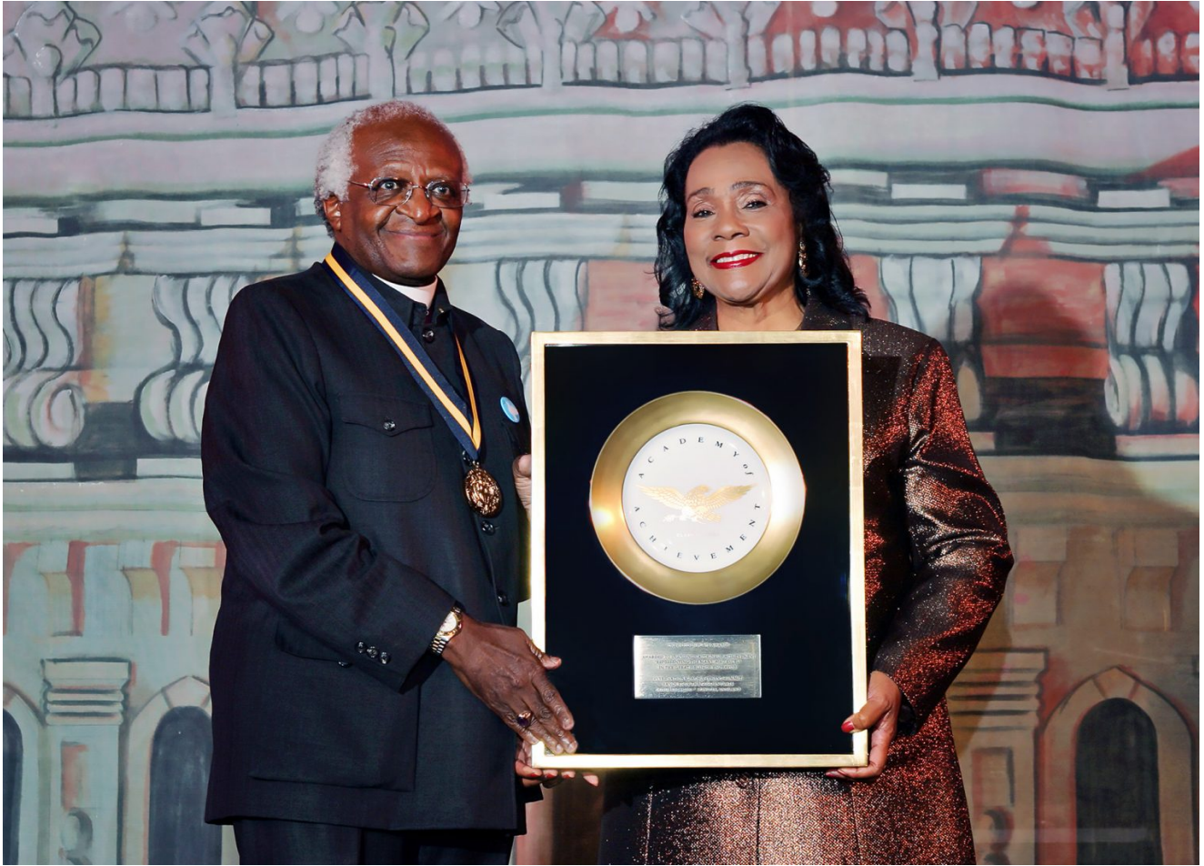
South Africa's Archbishop Desmond M. Tutu receives the American Academy of Achievement's Golden Plate Award from Council member Coretta Scott King during the 2003 International Achievement Summit in Washington, D.C.

Featured speakers included Bertie Ahern, Prime Minister of the Republic of Ireland; Latvian President Vaira Vike-Freiberga; NATO Secretary-General Lord Robertson; Benazir Bhutto, former Prime Minister of Pakistan; Lech Walesa, the former President of Poland; and Mikhail Gorbachev, former Premier of the Soviet Union.