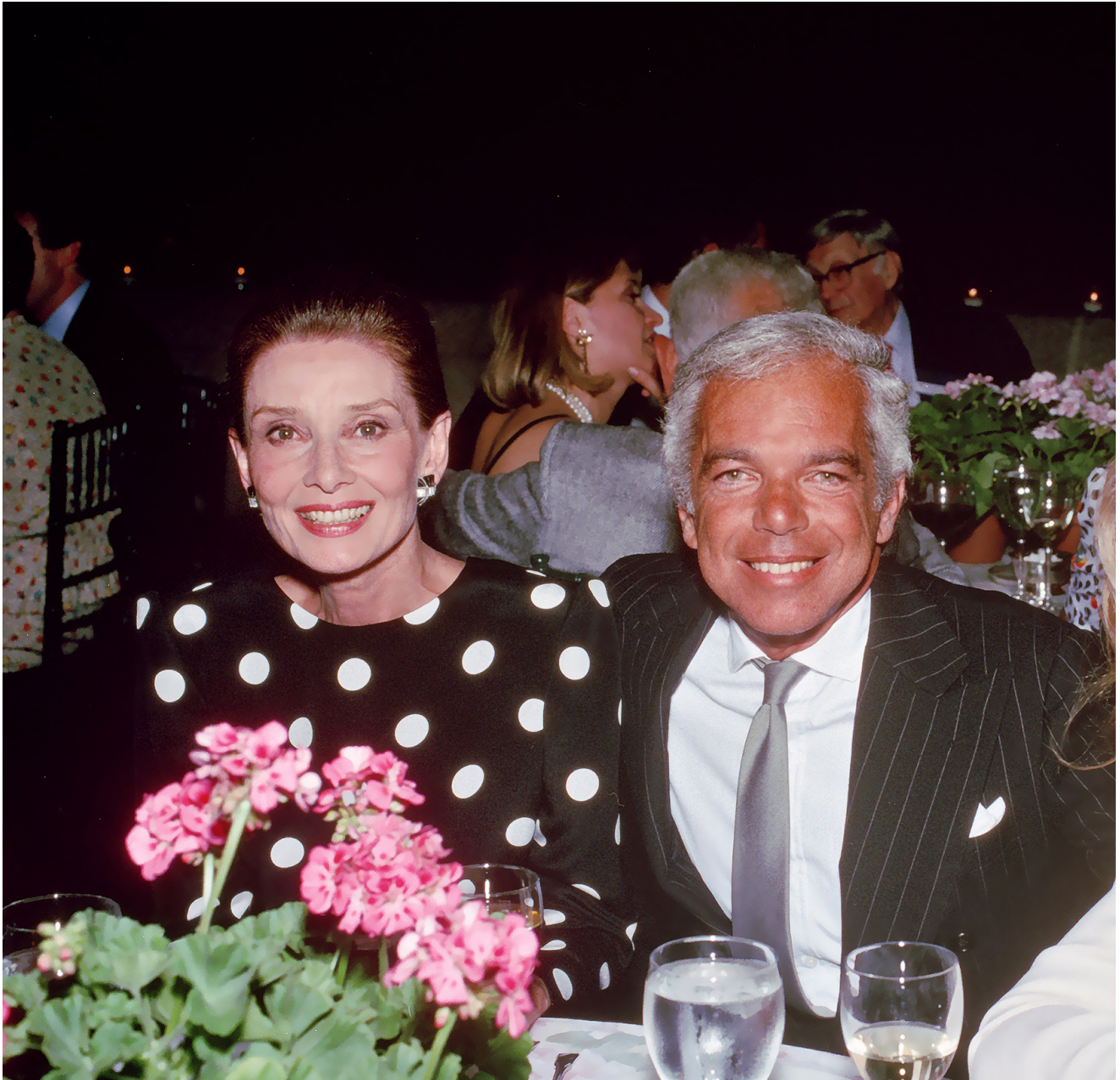
1991: Academy guest of honor and screen legend Audrey Hepburn with famed fashion designer and Golden Plate Awards Council member Ralph Lauren at the American Academy of Achievement's dinner held in New York City.

In June 2002, the 41st annual Salute to Excellence program and the third International Achievement Summit took place simultaneously in historic Dublin, capital of the Republic of Ireland. The Academy of Achievement invited 50 men and women of exceptional accomplishment (30 past honorees and 20 new awardees) to share their wisdom and experience with 200 outstanding graduate students from 40 countries in the disciplines of law, medicine, genetics, the sciences, engineering, economics, finance, journalism, international relations and diplomacy.