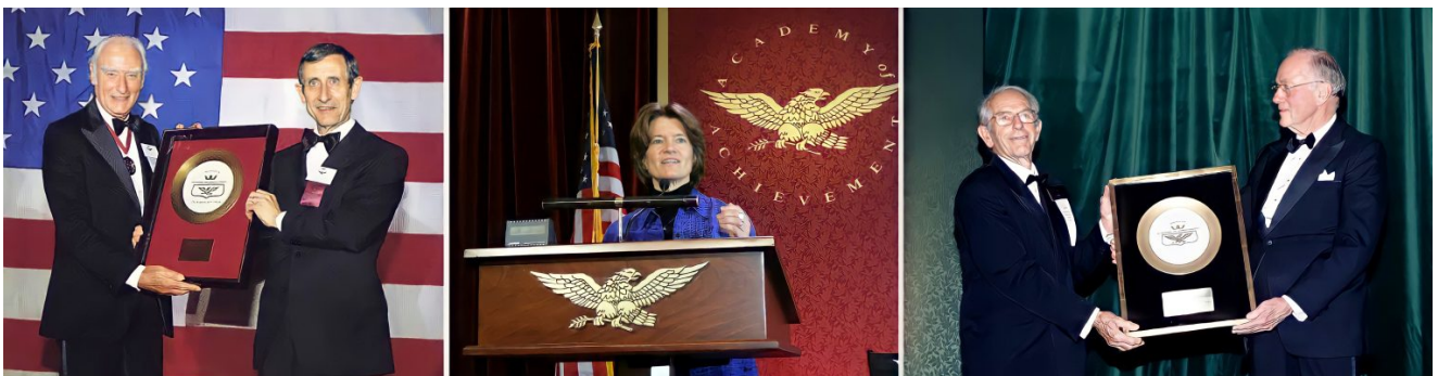
Awards Council member, theoretical physicist and futurist Dr. Freeman Dyson presenting the American Academy of Achievement's Golden Plate Award to Dr. Francis H.C. Crick, recipient of the Nobel Prize as the co-discoverer of the structure of DNA, during the 1987 Banquet of the Golden Plate ceremonies in Scottsdale, Arizona; Physicist and astronaut Dr. Sally K. Ride, the first American woman in space, addresses delegates and members at a symposium during the 2004 International Achievement Summit in Chicago, Illinois; Awards Council member and Nobel Prize laureate Dr. Charles H. Townes presenting the American Academy of Achievement's Golden Plate Award to British biochemist Dr. Frederick Sanger, recipient of two Nobel Prizes in Chemistry, at the 2000 Summit in Hampton Court.

For the inaugural Summit in Budapest, more than 100 outstanding international graduate students were selected by the Academy from nominations submitted by administrators of such international exchange programs as the Rhodes Scholarship Trust, Truman Scholarship Foundation and Fulbright Scholarship program.