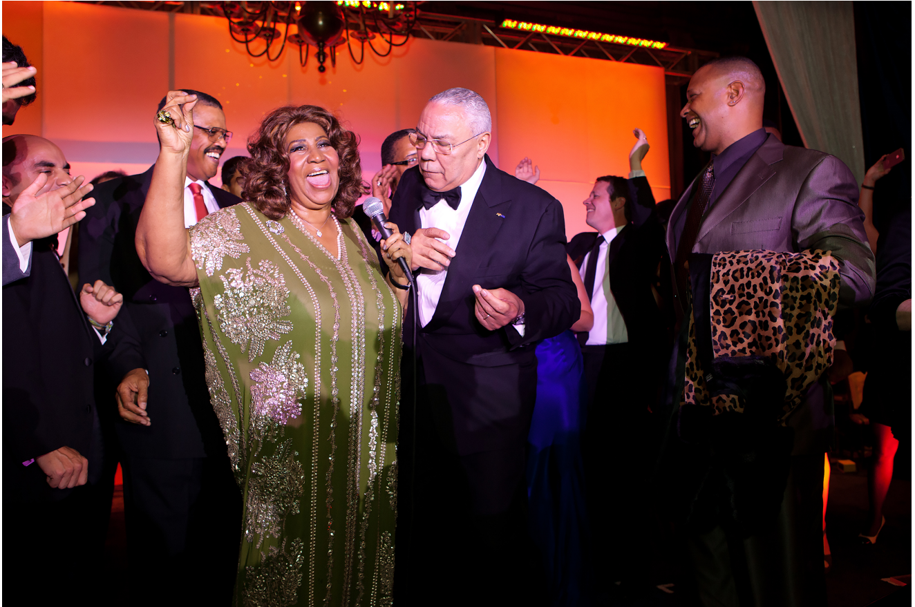
2012: Queen of Soul Aretha Franklin is joined onstage by Awards Council member General Colin Powell during her memorable musical performance to close the evening of the 50th annual Banquet of the Golden Plate ceremonies.

Additional student delegates were designated by the faculty of leading institutions around the world, including Harvard Law School, the Wharton School at the University of Pennsylvania, Georgetown University School of Foreign Service, the Sanger Centre at Cambridge, MIT School of Engineering, Columbia Graduate School of Journalism, Sofia University School of International Relations in Bulgaria, University College Dublin, the Max Planck Institute in Berlin, the Woodrow Wilson School of Public and International Affairs at Princeton, Institut d'Etudes Politiques de Paris, Moscow Institute of International Relations, Diplomatic Academy of Vienna, and the United States Military Academy, Naval Academy and Air Force Academy.