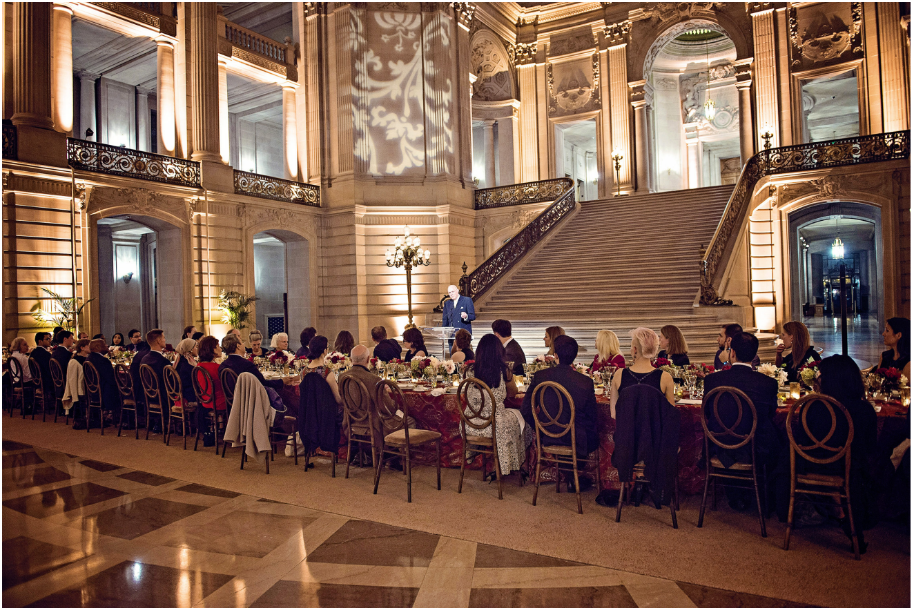
Justice Anthony M. Kennedy addresses the Academy delegates at the 2014 Achievement Summit in San Francisco.

For the inaugural Summit in Budapest, more than 100 outstanding international graduate students were selected by the Academy from nominations submitted by administrators of such international exchange programs as the Rhodes Scholarship Trust, Truman Scholarship Foundation and Fulbright Scholarship program.