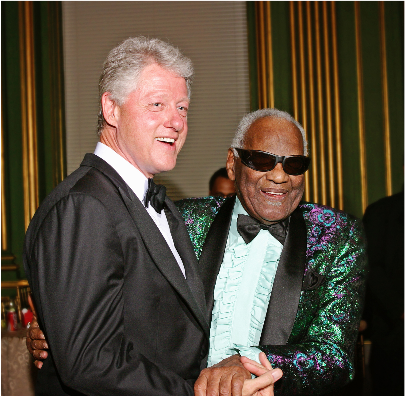
Golden Plate Awards Council member President Bill Clinton with the acclaimed singer and musician, Ray Charles, a 1975 American Academy of Achievement guest of honor, at the 2003 Banquet of the Golden Plate in Washington.

The 1999 International Achievement Summit also included a dialogue on the expansion of NATO with His Excellency Viktor Orbán, Prime Minister of the Republic of Hungary, in the historic Parliament building; a summary of the Kosovo crisis by General Wesley K. Clark, USA, the Supreme Allied Commander Europe; and a conversation on the pursuit of NATO membership with Her Excellency Nadezhda Mihailova, Foreign Minister of Bulgaria, and His Excellency Valdas Adamkus, President of the Republic of Lithuania.