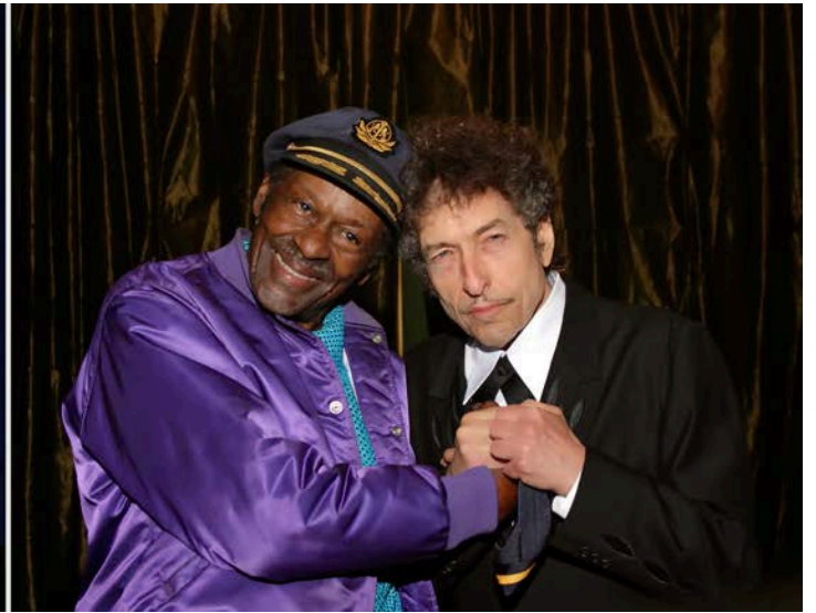
2003: Awards Council member and pioneer of rock and roll music Chuck Berry presents the American Academy of Achievement's Golden Plate Award to the legendary singer-songwriter and musician Bob Dylan at the Banquet of the Golden Plate ceremonies during the 42nd annual International Achievement Summit held in Washington, D.C.

The Academy members and graduate students participated in a number of memorable and inspiring events during the Summit, highlighted by presentations in the Palace of Justice from His Excellency Árpád Göncz, President of the Republic of Hungary, and Dr. Bronislaw Geremek, Foreign Minister of Poland, on their imprisonment by communist governments and their commitment to democracy.