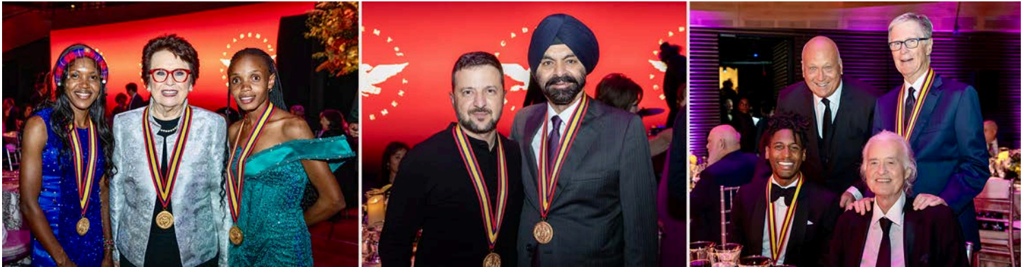
September 22, 2024: The Academy of Achievement's 55th Banquet of the Golden Plate at David Geffen Hall, Lincoln Center, New York City. (Left) Guests of Honor: World Athlete of the Year Faith Kipyegon, Presidential Medal of Freedom recipient Billie Jean King, and Olympic Gold Medalist Beatrice Chebet. (Center) Ukrainian President Volodymyr Zelenskyy with World Bank President Ajay Banga. (Right) Baseball Hall of Famer Cal Ripken Jr., Boston Red Sox owner John W. Henry, singer-songwriter Jon Batiste, and Led Zeppelin founder and guitarist Jimmy Page.

In 2024, the Banquet of the Golden Plate was held in the distinguished setting of David Geffen Hall at Lincoln Center, New York City, home of the New York Philharmonic. This prestigious event celebrated an illustrious group of honorees, including Nobel laureates, Grammy and Pulitzer Prize winners, heads of state, and Presidential Medal of Freedom recipients. The evening brought together extraordinary figures from diverse fields—such as the arts, athletics, literature, science, and business—honoring Olympic champions, pioneering medical researchers, visionary business leaders, and globally acclaimed artists, all united in recognition of their unparalleled achievements and contributions to society.