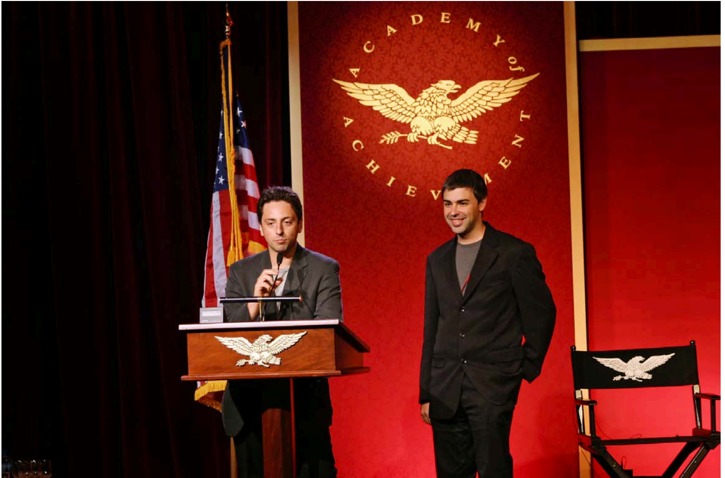
Chicago 2004: Google co-founders Sergey Brin and Larry Page, former Academy delegates at 2000 International Achievement Summit, returned as Golden Plate Awardees and symposium presenters at the 43rd annual Summit.

Delegate nominations were also provided by the faculty of more than 25 institutions, including the John F. Kennedy School of Government at Harvard, the Fletcher School of Law and Diplomacy at Tufts, Georgetown University School of Foreign Service, Woodrow Wilson School of Public and International Affairs at Princeton, Institute of Political Studies in Paris, School of Advanced International Studies at Johns Hopkins, Stanford Business School, Harvard Law School, United States Military Academy, Naval Academy and Air Force Academy.