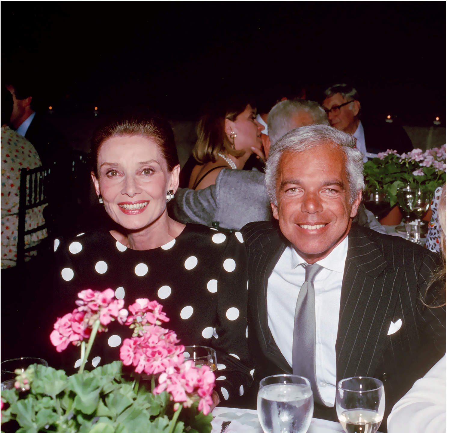
1991: Academy guest of honor and screen legend Audrey Hepburn with famed fashion designer and Golden Plate Awards Council member Ralph Lauren at the American Academy of Achievement's dinner held in New York City.

In June 2002, the 41st annual Salute to Excellence program and the third International Achievement Summit took place simultaneously in historic Dublin, capital of the Republic of Ireland. The Academy of Achievement invited 50 men and women of exceptional accomplishment (30 past honorees and 20 new awardees) to share their wisdom and experience with 200 outstanding graduate students from 40 countries in the disciplines of law, medicine, genetics, the sciences, engineering, economics, finance, journalism, international relations and diplomacy.