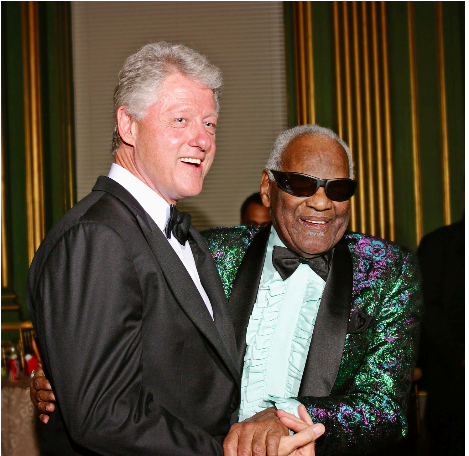
Golden Plate Awards Council member President Bill Clinton with the acclaimed singer and musician, Ray Charles, a 1975 American Academy of Achievement guest of honor, at the 2003 Banquet of the Golden Plate in Washington.

The 1999 International Achievement Summit also included a dialogue on the expansion of NATO with His Excellency Viktor Orbán, Prime Minister of the Republic of Hungary, in the historic Parliament building; a summary of the Kosovo crisis by General Wesley K. Clark, USA, the Supreme Allied Commander Europe; and a conversation on the pursuit of NATO membership with Her Excellency Nadezhda Mihailova, Foreign Minister of Bulgaria, and His Excellency Valdas Adamkus, President of the Republic of Lithuania.