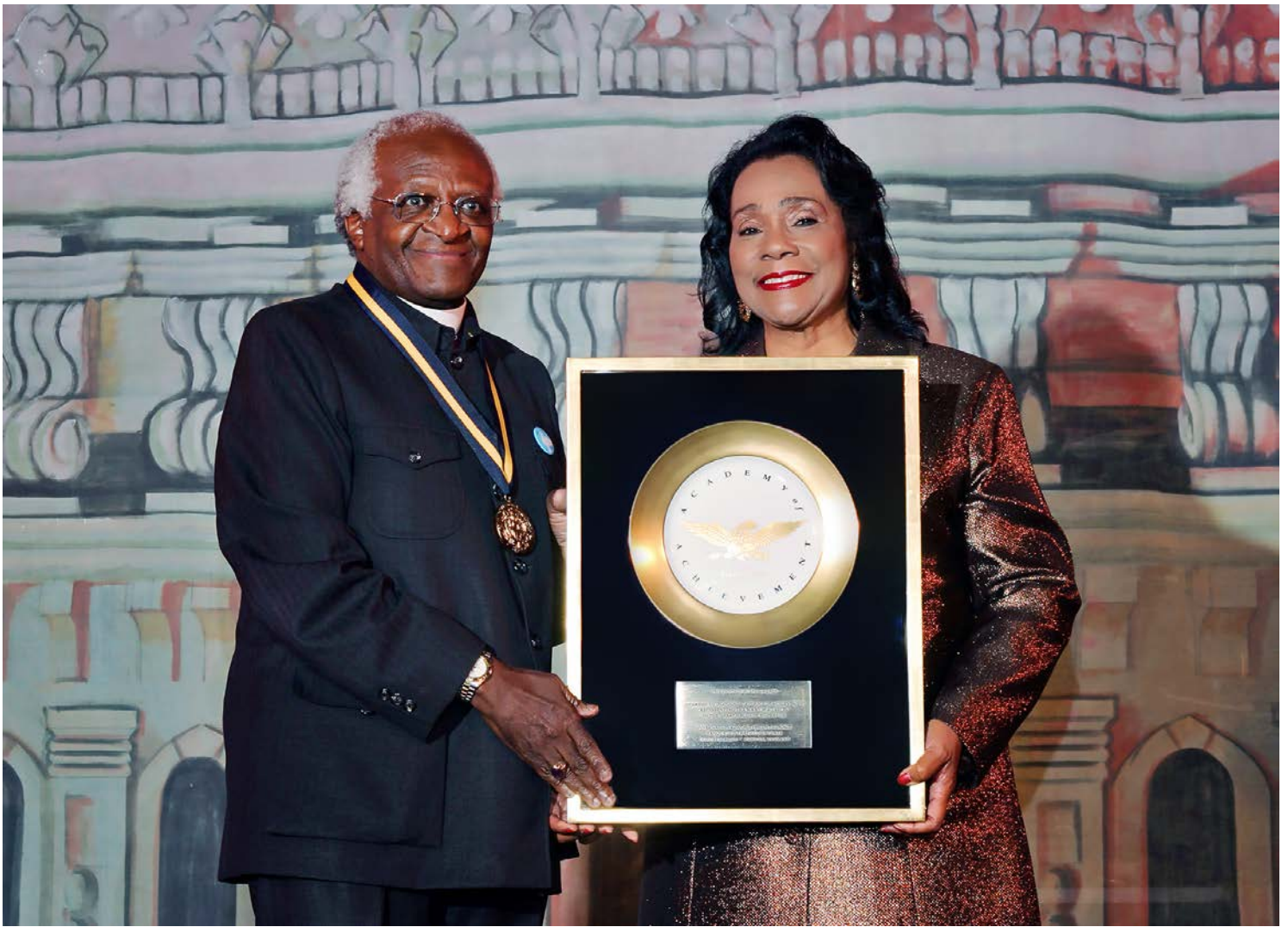
South Africa's Archbishop Desmond M. Tutu receives the American Academy of Achievement's Golden Plate Award from Council member Coretta Scott King during the 2003 International Achievement Summit in Washington, D.C.

Featured speakers included Bertie Ahern, Prime Minister of the Republic of Ireland; Latvian President Vaira Vike-Freiberga; NATO Secretary-General Lord Robertson; Benazir Bhutto, former Prime Minister of Pakistan; Lech Walesa, the former President of Poland; and Mikhail Gorbachev, former Premier of the Soviet Union.