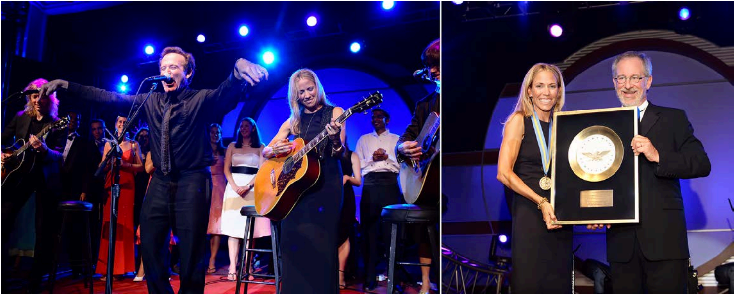
Actor and comedian Robin Williams performing a spontaneous “Academy rap” with the Grammy-winning singer-songwriter Sheryl Crow at the 2006 Banquet of the Golden Plate ceremonies during the 45th annual International Achievement Summit held in Los Angeles. Awards Council member and filmmaker Steven Spielberg presenting the Academy of Achievement’s Golden Plate Award to Sheryl Crow after her performance at the Banquet ceremonies.

The second International Achievement Summit took place at Claridge’s in London, England, in October 2000. The American Academy of Achievement invited 30 men and women of exceptional accomplishment to share their wisdom and experience with 200 outstanding graduate students in the disciplines of law, medicine, the sciences, economics and international affairs. The assembled students represented over 40 different countries and more than 25 institutions of higher learning.