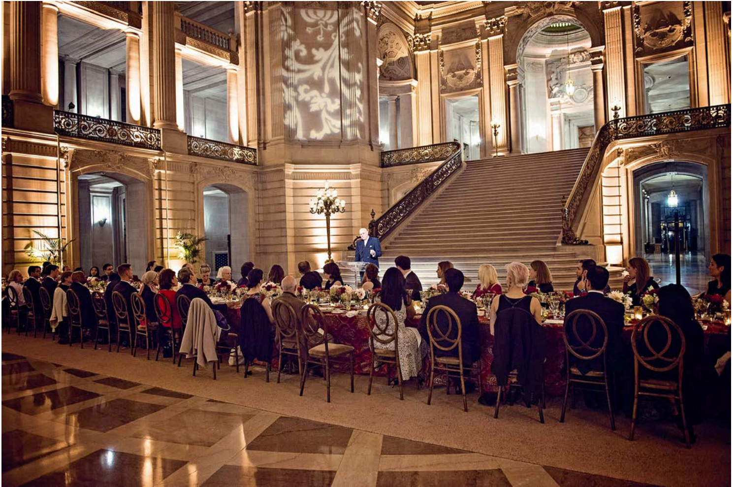
Justice Anthony M. Kennedy addresses the Academy delegates at the 2014 Achievement Summit in San Francisco.

program by bringing together men and women of exceptional accomplishment to share their experiences with remarkable young people from around the world, with an adjusted focus toward graduate-level scholars.