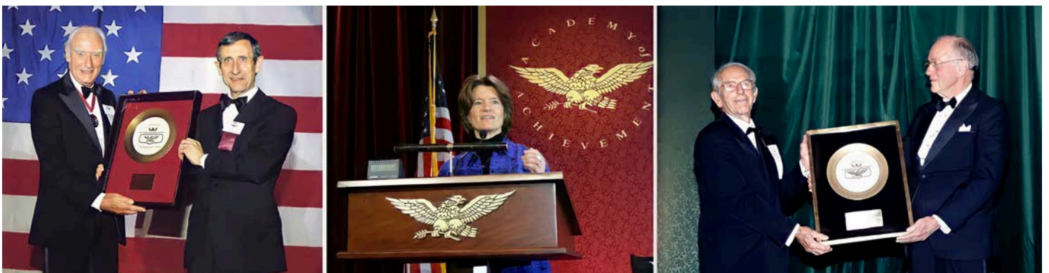
Awards Council member, theoretical physicist and futurist Dr. Freeman Dyson presenting the American Academy of Achievement's Golden Plate Award to Dr. Francis H.C. Crick, recipient of the Nobel Prize as the co-discoverer of the structure of DNA, during the 1987 Banquet of the Golden Plate ceremonies in

For the inaugural Summit in Budapest, more than 100 outstanding international graduate students were selected by the Academy from nominations submitted by administrators of such international exchange programs as the Rhodes Scholarship Trust, Truman Scholarship Foundation and Fulbright Scholarship program.