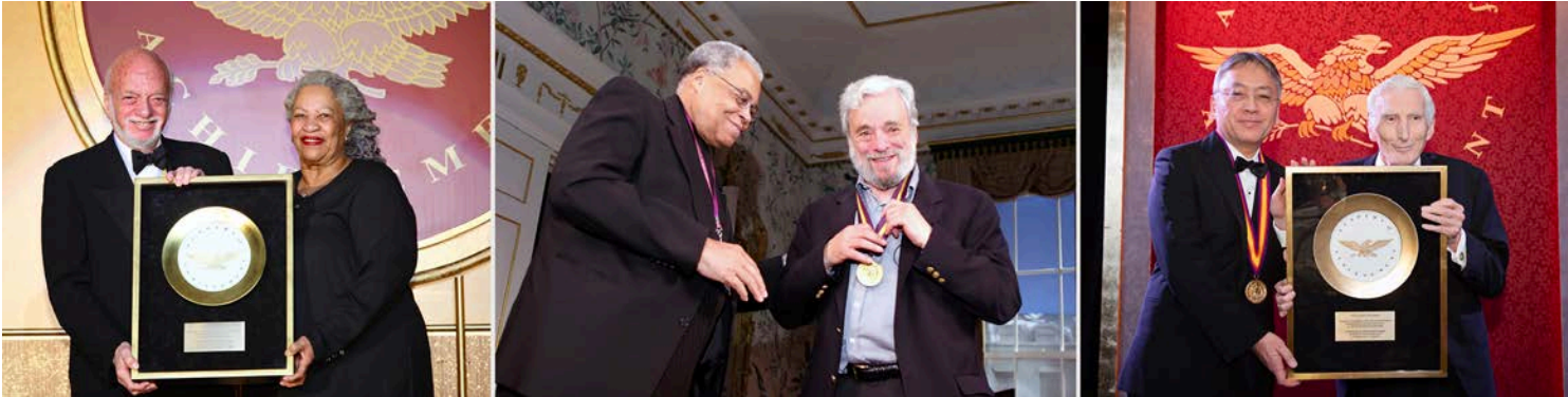
Hal Prince receives the Golden Plate Award from Awards Council member and Nobel laureate Toni Morrison during the American Academy of Achievement’s 2007 Banquet of the Golden Plate gala ceremonies in Washington, D.C.; Composer and lyricist Stephen Sondheim receives the Academy’s Gold Medal from Awards Council member James Earl Jones at the 2005 International Achievement Summit during a Broadway symposium in New York City; Awards Council member and Astronomer Royal Lord Martin Rees presents the Golden Plate Award to Nobel Prize-winning British novelist, screenwriter, and short-story writer Kazuo Ishiguro at the 2017 Achievement Summit in London.

Subsequent International Achievement Summits have occurred in Chicago, New York and Los Angeles, as well as Kailua-Kona, Hawaii, Cape Town, South Africa, Washington, D.C., San Francisco, and London, England.