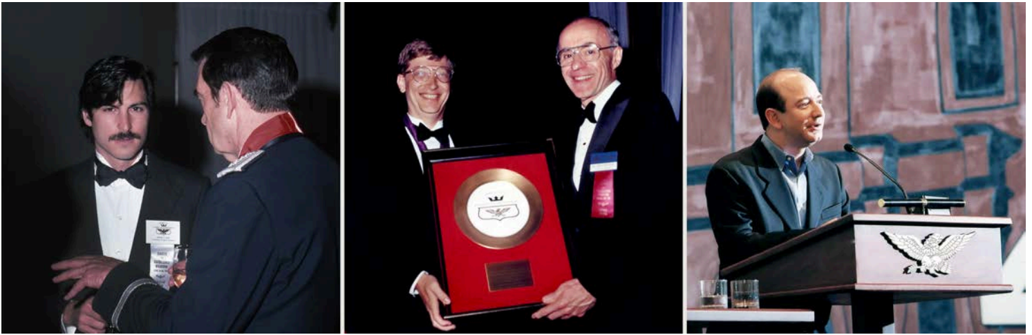
Three Titans of Tech: (Left) Steven P. Jobs, the 26-year-old co-founder and the board chairman of Apple Computer Company, with General David C. Jones, USAF, Golden Plate Awards Council co-chairman and the Chairman of the Joint Chiefs of Staff, at the American Academy of Achievement's 1982 Banquet of the Golden Plate in New Orleans, Louisiana; (Center) Microsoft's Co-Founder and Chairman, Bill Gates, receives the Golden Plate Award from Awards Council member, Dr. Arno A. Penzias, recipient of the Nobel Prize in Physics, during the 1992 American Academy of Achievement Summit in Las Vegas; (Right) Jeff Bezos, founder and CEO of Amazon.com, addressing the Academy student delegates and members during the 2001 Academy of Achievement Summit program in San Antonio, Texas.

The student delegates for the 2002 Summit were selected by prestigious international exchange programs, including the Rhodes Scholarship Trust, the White House Fellows program, Howard Hughes Medical Institute, Truman Scholar Foundation, and the Marshall and Fulbright Scholarship programs.